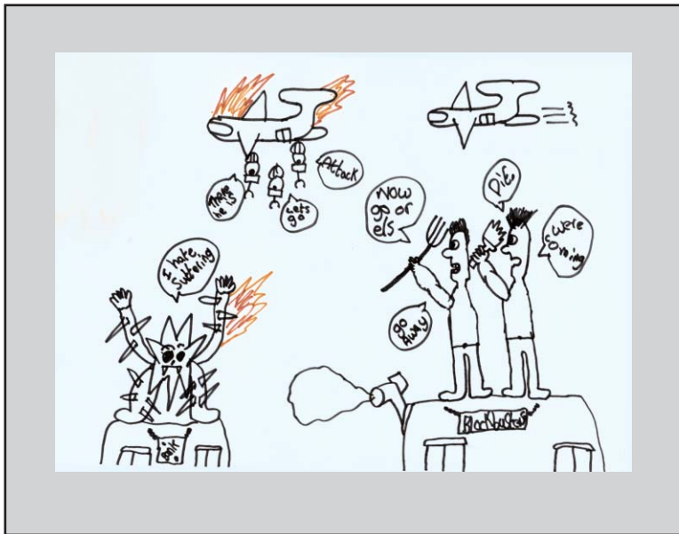
A's first Drawing

These drawings are from A aged 8: .— A said of the first drawings; -