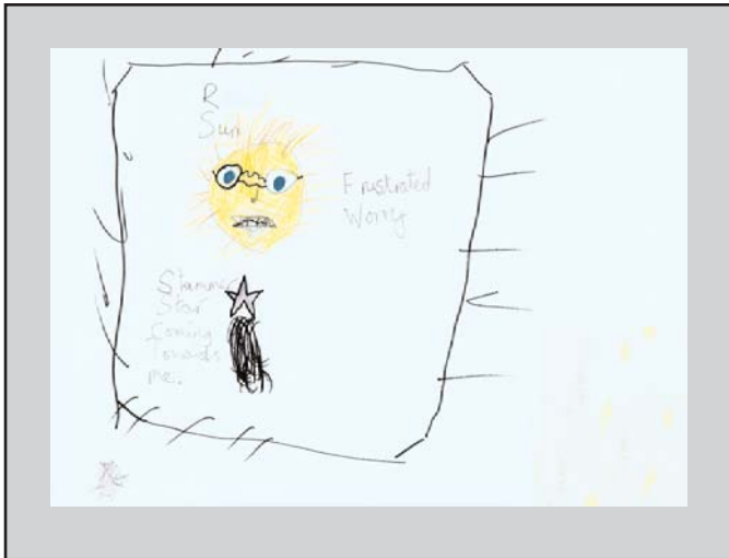
Rs first drawing

In the summer of 2002 the Stammer Trust funded my visit to the 6th Oxford Dysfluency Conference. There were many interesting presentations – some very academic and some more “hands on” practical ideas.