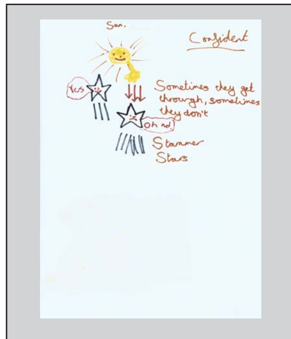
Rs second drawing

“I'm Ok now with my friends – I feel quite confident about my stammer it is better than it was but sometimes it comes through – at certain times when I'm talking to someone I don't know – like when I'm asking for a book at the library. The stammer stars help me when I'm in a situation when I know I'm going to stammer and then I can use them”.